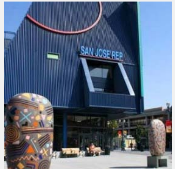
San Jose Repertory Theatre